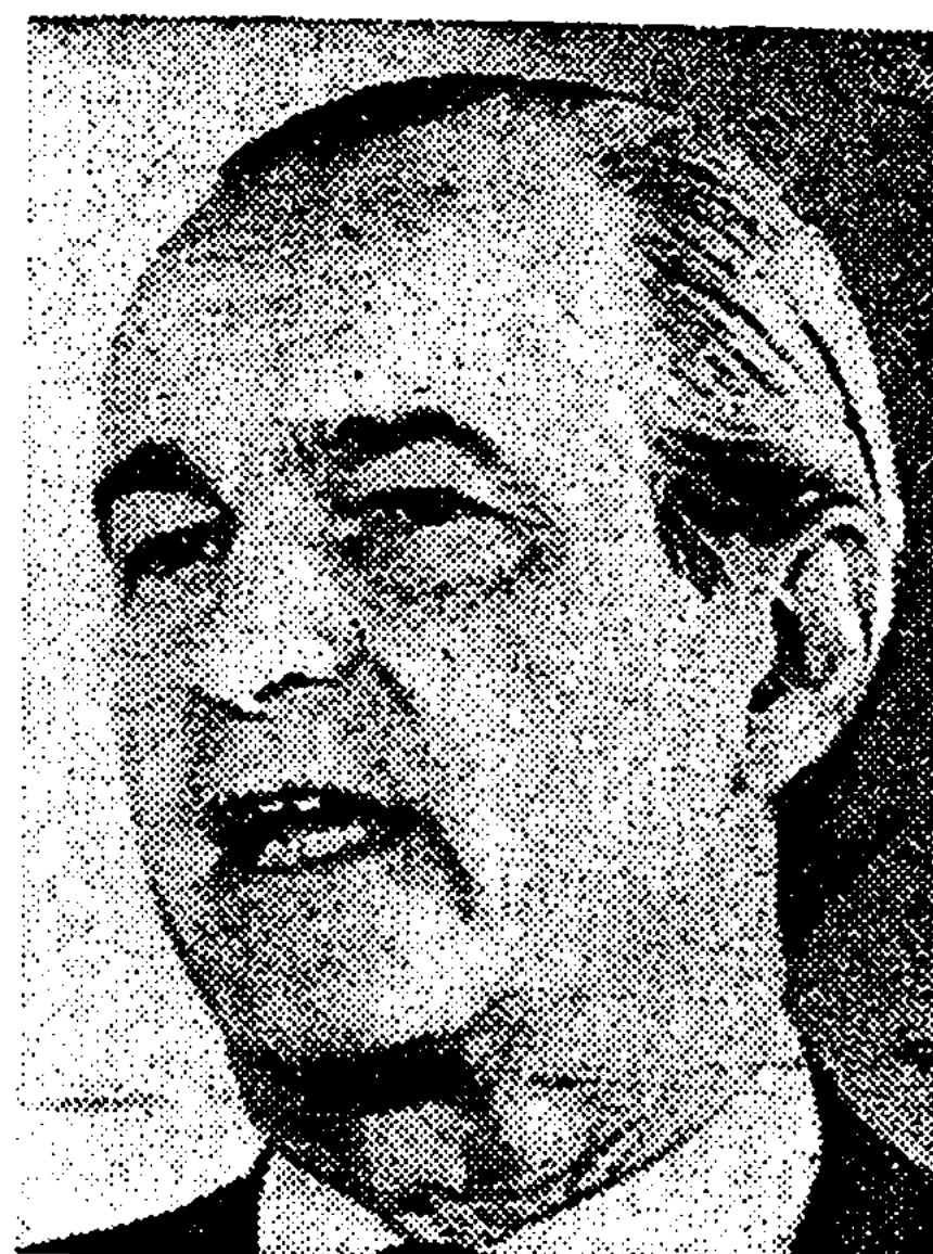
Richard Helms, former director of the C.I.A.

would have to be renewed. I wouldn't say any responsible publisher would say, 'I've got an arrangement with Allen Dulles and it goes without saying that I have the same thing with John McCone.'"